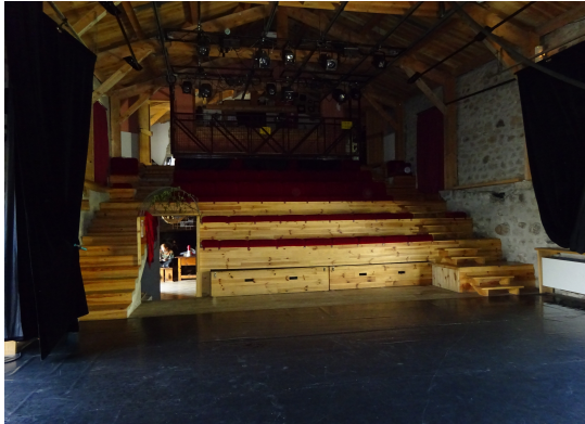
Theatre of l'Arentelle