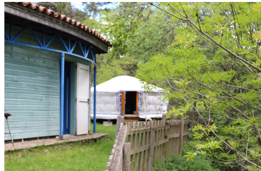
Accommodation in house or yurts