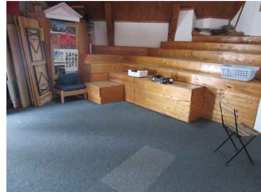
Theatre of Le Moulin